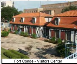
Fort Conde - Visitors Center