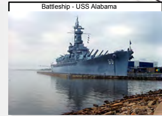
Battleship - USS Alabama